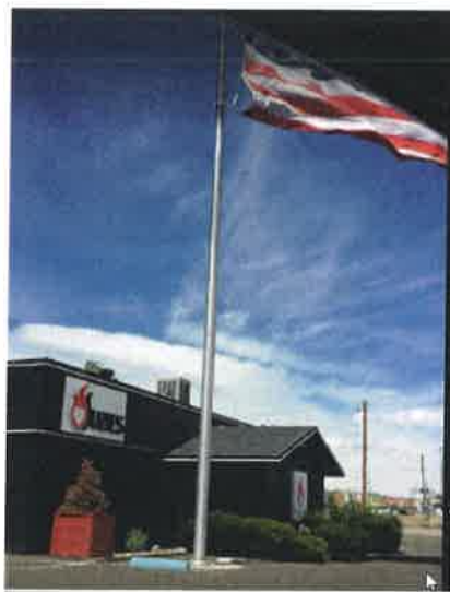
Photograph of exterior of Suzie's

Suzie's has a reputation of average cleanliness and for attracting a mid-income demographic of patrons.