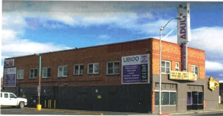
Photograph of exterior of Libido Adult Store & Theater

Website: https://www.libidoadultstore.com/home