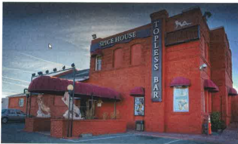
Photograph of exterior of Spice House.

The Spice House has the reputation for minimum cleanliness and for attracting a low-income demographic of clientele.