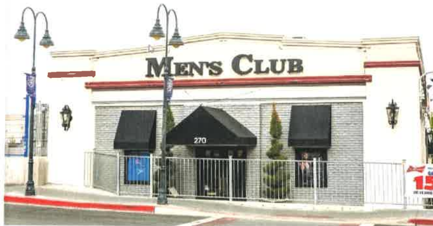
Photograph of exterior of Men's Club