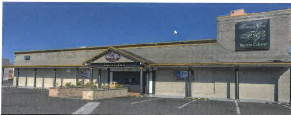
Photograph of exterior of Fantasy Girls

Fantasy Girls is among the least hygienic exotic clubs, and is known for attracting a lower-income demographic of clientele.