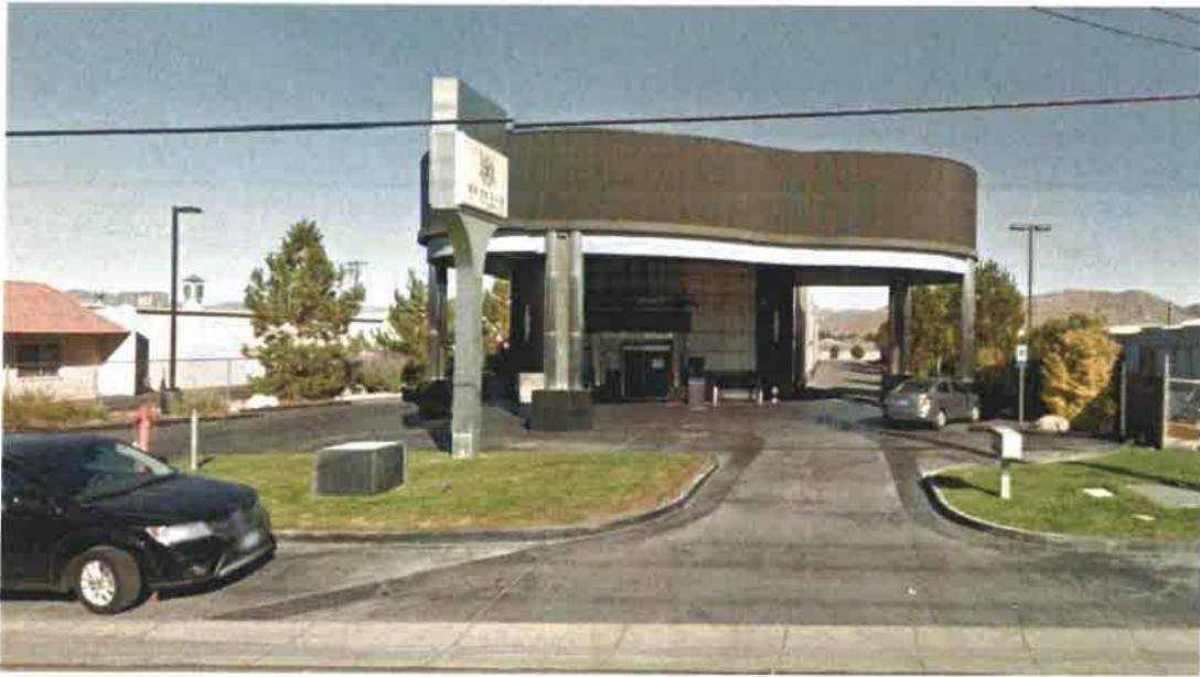
Photograph of exterior of Show Girls