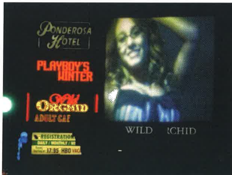
The video sign outside the Wild Orchid gentleman's club at the north end of Reno's Midtown is one of the area's most criticized digital signs.

For years, the Wild Orchid and other strip club establishments have existed without much public outcry. The Wild Orchid sign was just what this community needed to start paying attention and take action. Our community is now unwilling to ignore business activities that are obviously inconsistent with our values, as well as the reputation and image Reno desires to promote. Now everyone is asking the question, "Is this sign what we want our city to be known for?" The answer is emphatically, "No!" The community will no longer tolerate the degradation and exploitation of men, women and children.