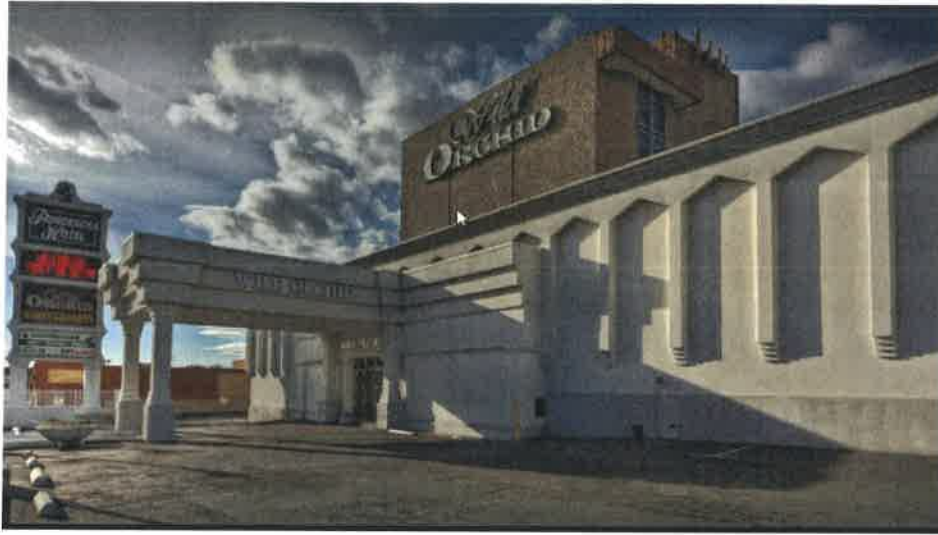
Photograph of exterior of Wild Orchid

The Wild Orchid occupies a coveted spot on the edge of Reno's Downtown and burgeoning Midtown districts. Nestled against the Ponderosa Hotel, which is a haven for transients, homeless people, and prostitutes, the Wild Orchid is an eyesore and unwelcome element in an otherwise booming part of town. The Wild Orchid's VIP room is known to host various sexual activities and drug use between patrons and dancers alike, although access to the VIP room seems to be slightly more exclusive compared to Reno's lower-end exotic clubs. The Wild Orchid is known to be a relatively clean establishment, which attracts mid-to-high income patrons.